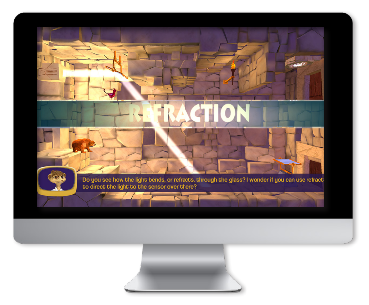
» Example of in-game scaffolding for Martha Madison: Optics

Since that time, Second Avenue Learning has been awarded with additional grants (Phases II and IIB) from the NSF to develop a full game-based curriculum suite for middle school physical science. Here, we describe the extensive qualitative and quantitative research that has informed every stage of the design and development of Martha Madison . Our findings have demonstrated that Martha Madison is an effective and exciting approach to science education for students of both genders and across all socioeconomic groups. This research is key to the creation of products that not only enhance learning, but inspire young minds through fun, play, and exploration of authentic science.