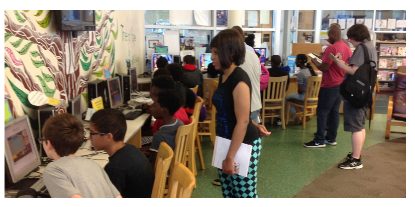
» Playtesting Martha Madison: Optics in upstate New York library

All participants took part in two research sessions which occurred in a lab at the Rochester Institute of Technology. Both sessions were designed to fit within the time frame of a typical middle school period. During the first session, demographic and technical literacy data was collected, along with survey data pertaining to participants' perceptions of the STEM disciplines. A content pre-assessment was completed at the end of this session. The second session took place in the same lab. During this session, participants were paired and asked to play through the four levels of the Simple Machines game prototype. Following the play session, students completed a postsurvey of STEM perception as well as a content post-assessment.